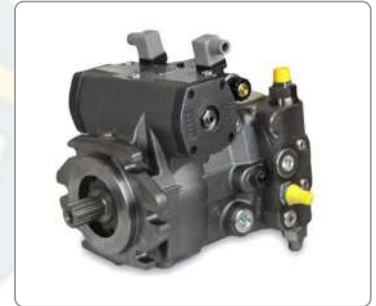
REXROTH A4VG71 SERIES