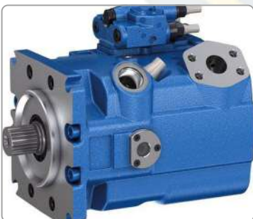
LINDEY HYDRAULIC PUMP