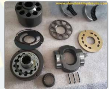
REXROTH A10VG45 SPARES