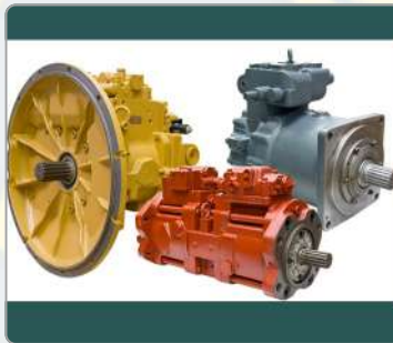
KAWASAKI HYDRAULIC PUMPS