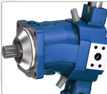
REXROTH HYDRAULIC MOTOR