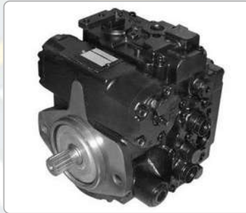
DANFOSS 42R41 SERIES