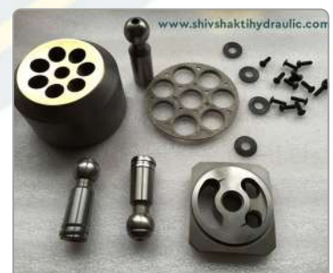
REXROTH A10VS107 SPARES