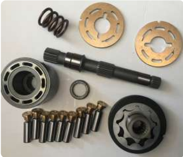
DANFOSS 42R41 SPARES