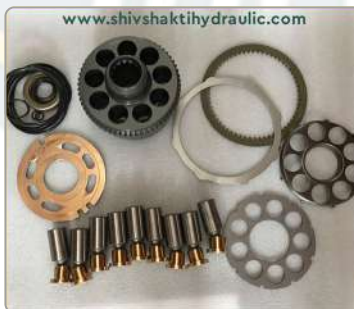
KAWASAKI REPAIR KIT