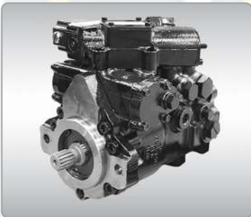
DANFOSS MPVO46 PUMP MOTOR