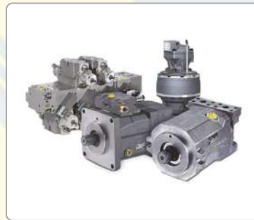
LINDY HYDRAULIC PUMP MOTOR