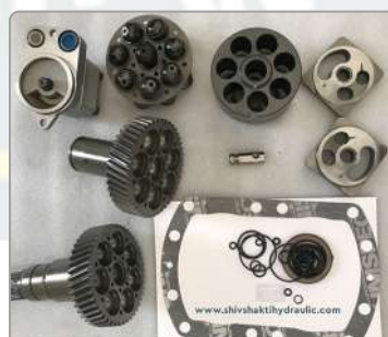
CATERPILLAR PUMP SPARES